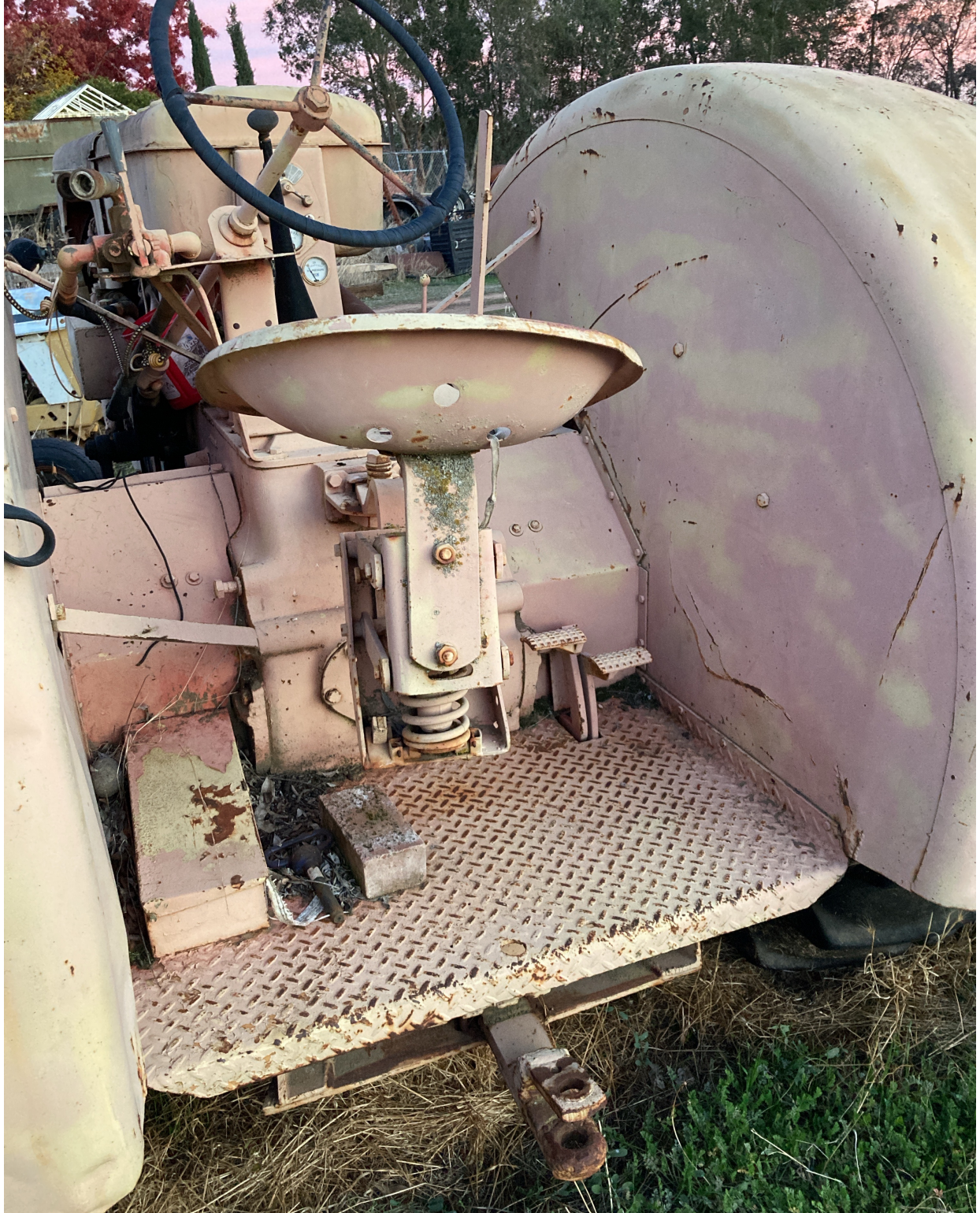
Minneapolis moline ZTS